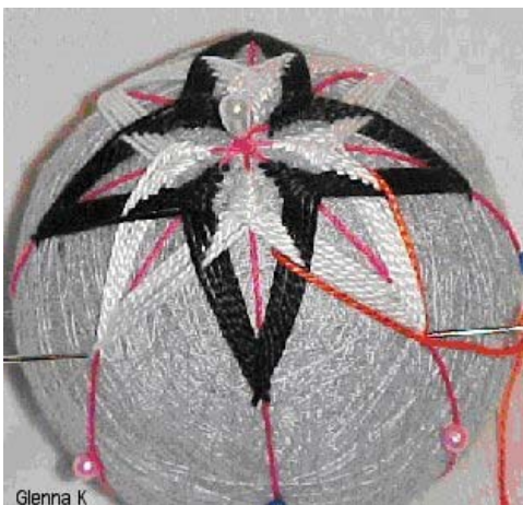
Photo 2 shows the completion of one Orange outline. The needle shows the path into the wrap thread and out at the start point for Orange outline.