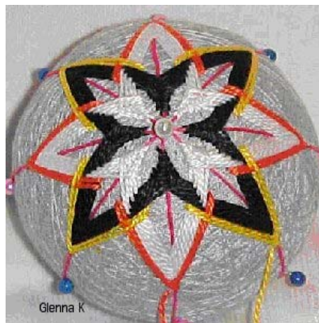
Photo 3 shows 2 complete rounds of outline. The White Kiku element is outlined with Orange. The Black Kiku element is outlined with Yellow.