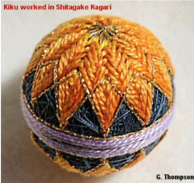
Kiku worked in Shitagake Kagari